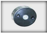
参比电极 Reference Cell

We can supply according to your requirement, drawings, class certificate needs, and delivery schedule.