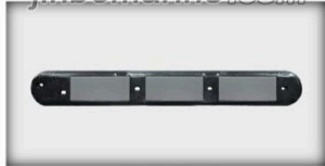
长条型阳极 Linear Stripe Anode