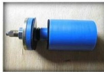
参比电极 Reference Cell