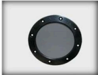
圆型阳极 Circular Anode