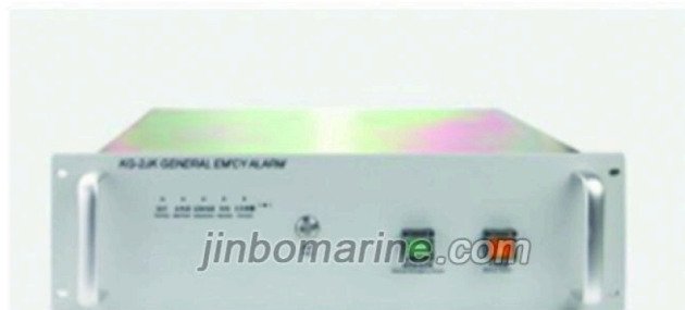
KG-2JK/KG-2JKB(配KG-4) KG-2JK/KG-2JKB(Match KG-4)