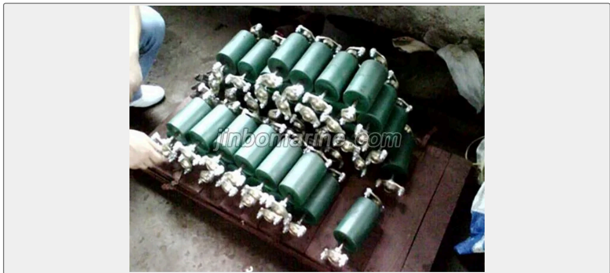
B3 Metal Spring Hanger