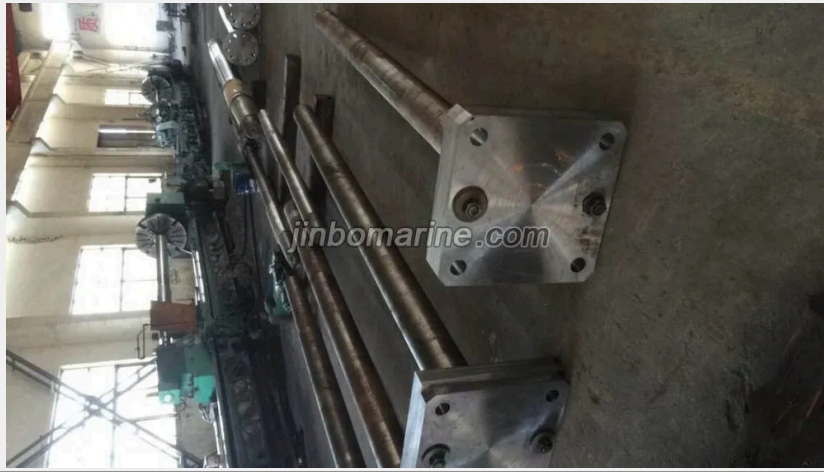
Stern Tube White Metal Bearing