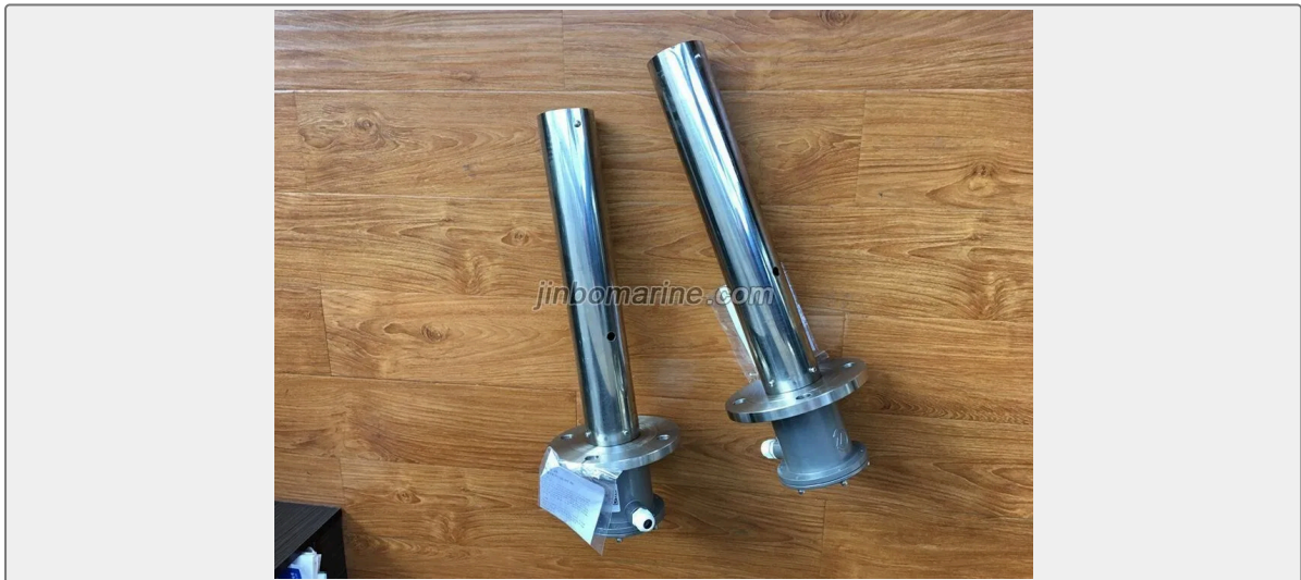
UQK-652-C Type Float Level Controller With Self Test Device