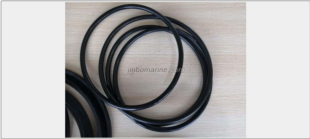
YH3-220 Seal Ring